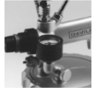
AN ADJUSTABLE SELF RELIEVING REGULATOR IS PROTECTED BY A SOLVENT RESISTANT CHECK VALVE TO PREVENT PAINT CLOGGING.

Compatible with any conventional air atomising, compliant or HVLP manual spray gun the KBII remote cup provides the answer where complete operator mobility and gun manoeuvrability are essential to the application size and scale. The cup operates from a single air supply line coupled to the inlet at the base of the handle.