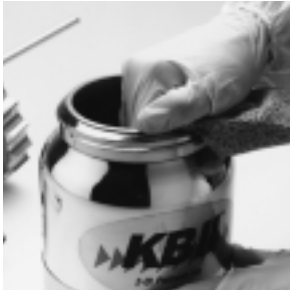
THE LARGE CUP MOUTH AND SMOOTH INTERIOR MAKE CLEANING OUT SIGNIFICANTLY EASIER.