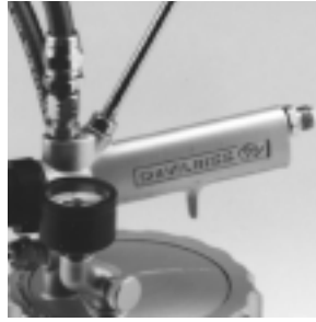
THE KBII FEATURES A UNIQUE 'GUN GRIP' CARRYING HANDLE WITH THE FIT AND FEEL OPERATORS PREFER