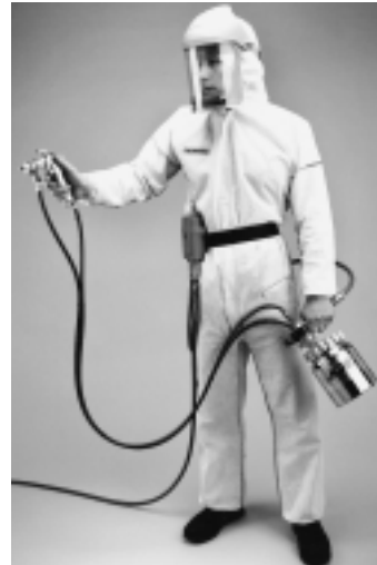
THE KBII REMOTE CUP OPERATES FROM A SINGLE SUPPLY LINE TO GIVE GREATER MANOEUVRABILITY WHEN WORKING IN DIFFICULT AND RESTRICTIVE AREAS